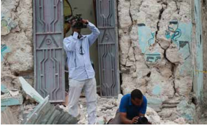
Journalists taking photos from the blast site in Mogadishu