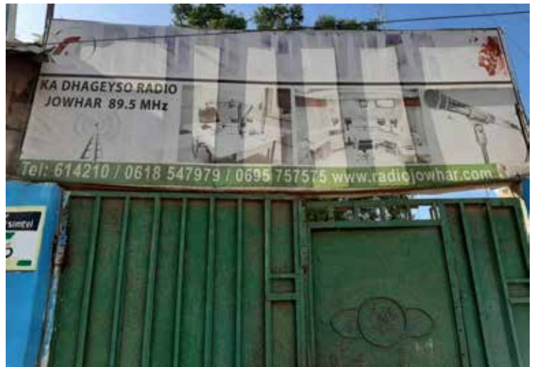
Radio Jowhar briefly shuttered.