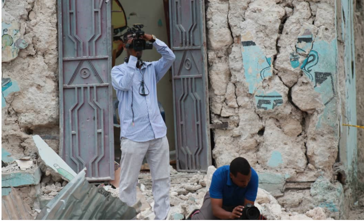
Journalists taking photos from the blast site in Mogadishu