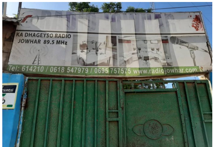
Radio Jowhar briefly shuttered.