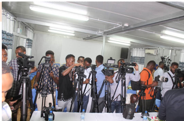
Journalists on duty